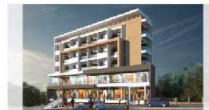
SMART CITY Main Road, Bhatkal