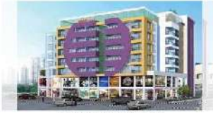
SMART CITY Thokkottu, Mangalore