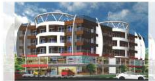
GREEN CITY Thokkottu, Mangalore