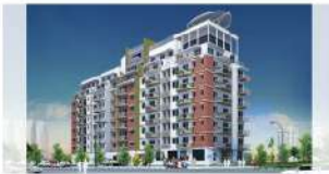
GARDEN CITY Thokkottu, Mangalore