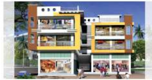
MAX CITY Rao & Rao Circle, Mangalore