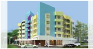
SMART PLANET Thokkottu, Mangalore