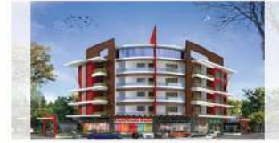
ROYAL PRIDE Bolar, Mangalore