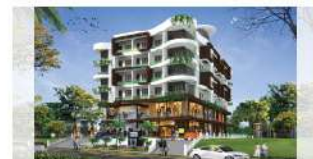
KINGDOM TOWER Thokkottu, Mangalore