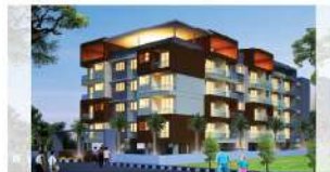
TAMAM APARTMENTS Krishnapura, Mangalore