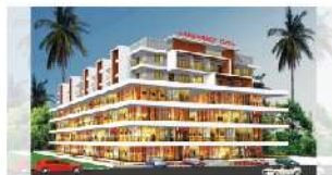
KANKANADY GATE Kankanady, Mangalore