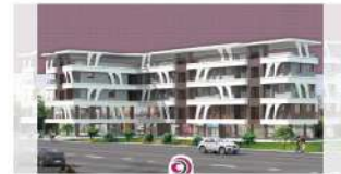
CITY MAX Vamanjoor, Mangalore