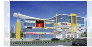
SAHAKARI SADANA Near Rao & Rao Circle, Mangalore