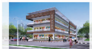
SUN CITY Thokkottu, Mangalore