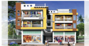
MAX CITY Rao & Rao Circle, Mangalore