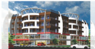
GREEN CITY Thokkottu, Mangalore