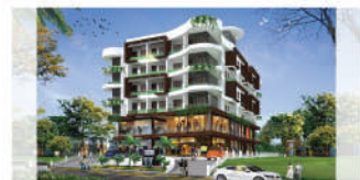
KINGDOM TOWER Thokkottu, Mangalore