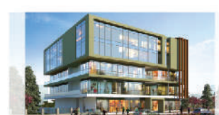
PADIL GATE Padil, Mangalore