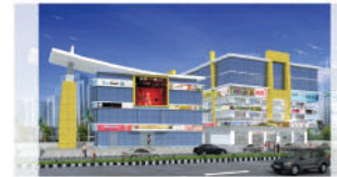
SAHAKARI SADANA Near Rao & Rao Circle, Mangalore