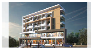
SMART CITY Main Road, Bhatkal