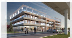
GRAND CITY Thokkottu, Mangalore