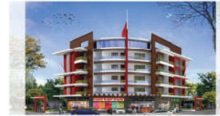
ROYAL PRIDE Bolar, Mangalore