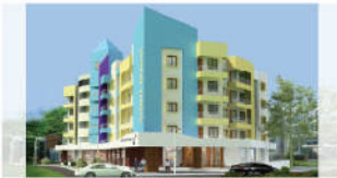
SMART PLANET Thokkottu, Mangalore