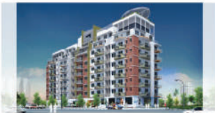
GARDEN CITY Thokkottu, Mangalore