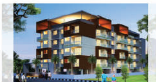
TAMAM APARTMENTS Krishnapura, Mangalore