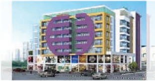
SMART CITY Thokkottu, Mangalore