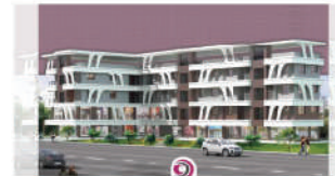
CITY MAX Vamanjoor, Mangalore